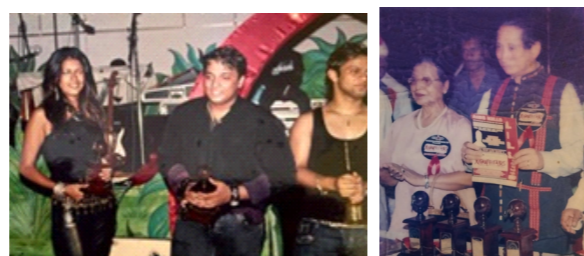
Celebrities at the GRAFFITAID Launch Event.